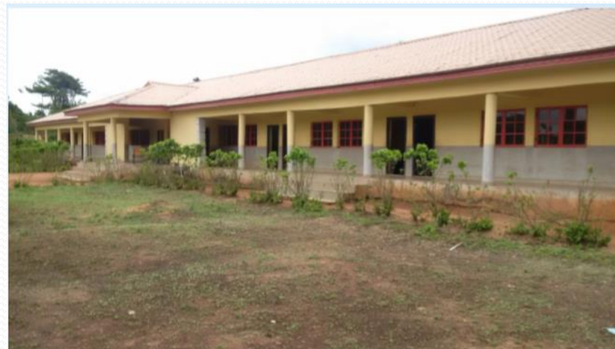
Block of Six at Ajoki