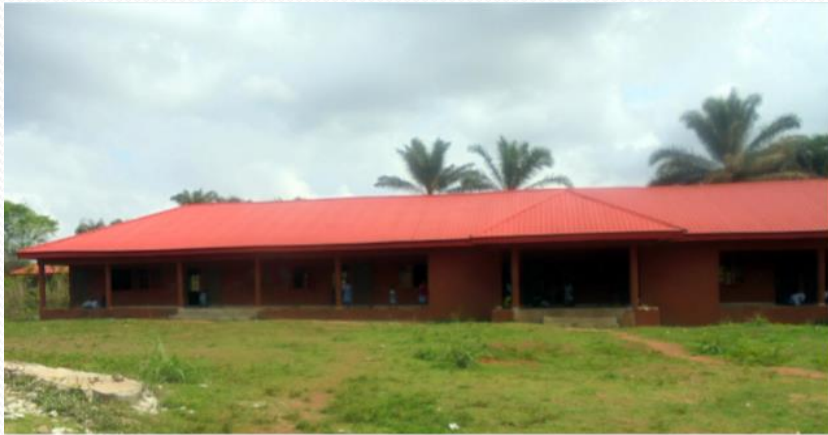
Iru Pry Sch. Iru.