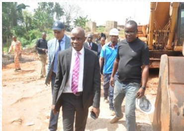
INSPECTION ABUDU BRIDGE IN ORHIONMWON L.G.A