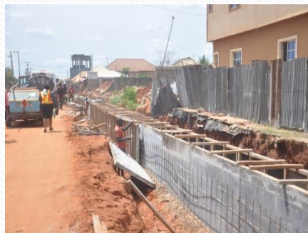
ON-GOING CONSTRUCTION OF PZ ROAD, OFF SAPELE ROAD IN IKPOBA-OKHA L.G.A