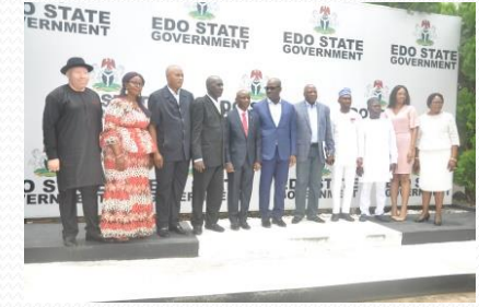
GROUP PHOTOGRAPH WITH THE GOVERNOR