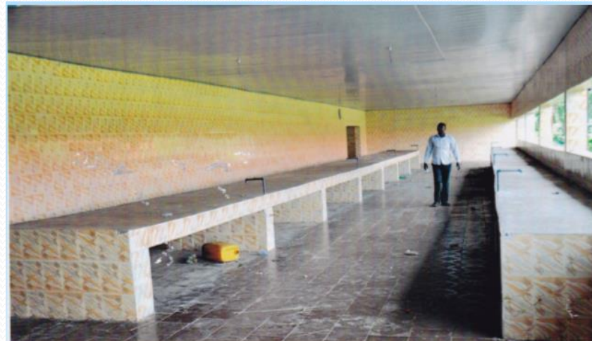
Inside the Abattoir @ Ugo