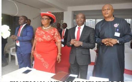
CHAIRMAN AND SOME MEMBERS OF THE COMMISSION DURING EDSOGPADEC NINE LESSONS AND CAROLS.