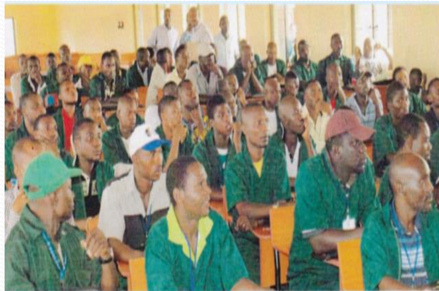
Skill Acquisition in various aspects of Agriculture (including Livestock farming) for trainees from Ikpoba-Okha