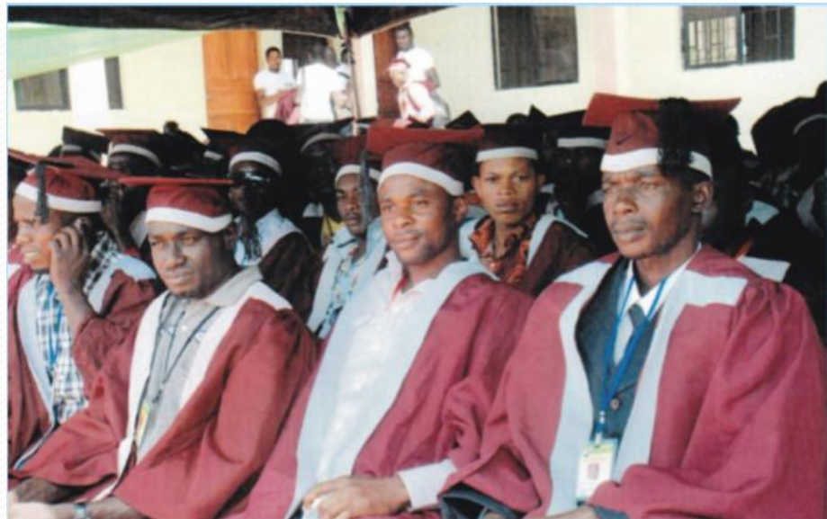
EDSOGPADEC Trainees at their Graduation from I.O Farms in Amagba, G.R.A, Benin City.