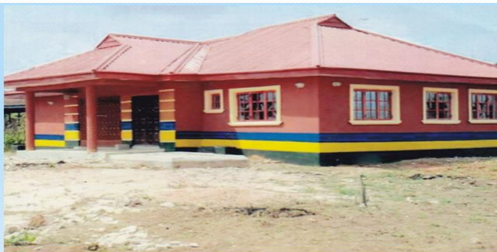
Police Post at Obayantor