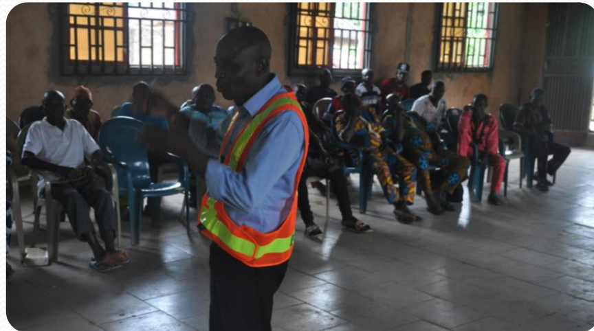
Ovia North-East L.G.A