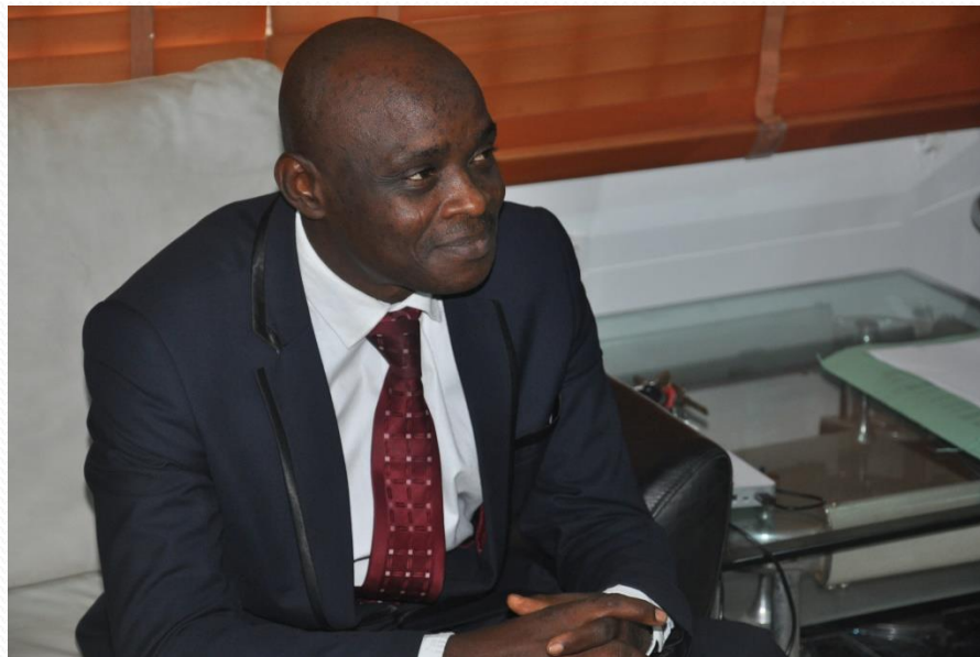
THE COMMISSION'S CHAIRMAN DURING THE VISIT