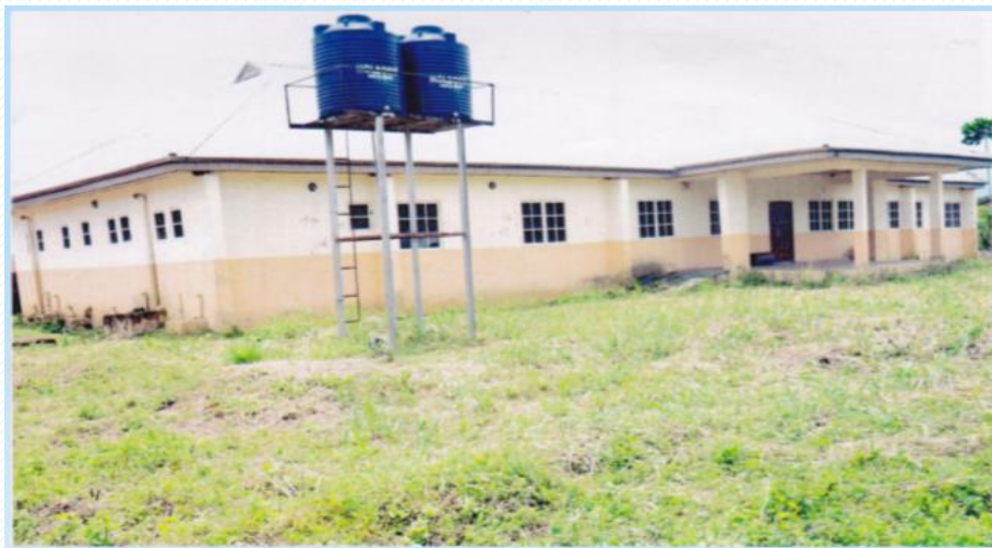
A Primary Health Care Centre in Obagie Nunuamen