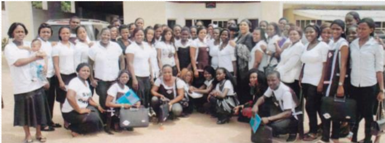
Ovia North East Trainees in Hair-Making, Fashion and Design