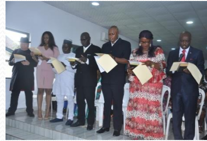
SWEARING-IN CELEMONY OF COMMISSION'S MEMBERS