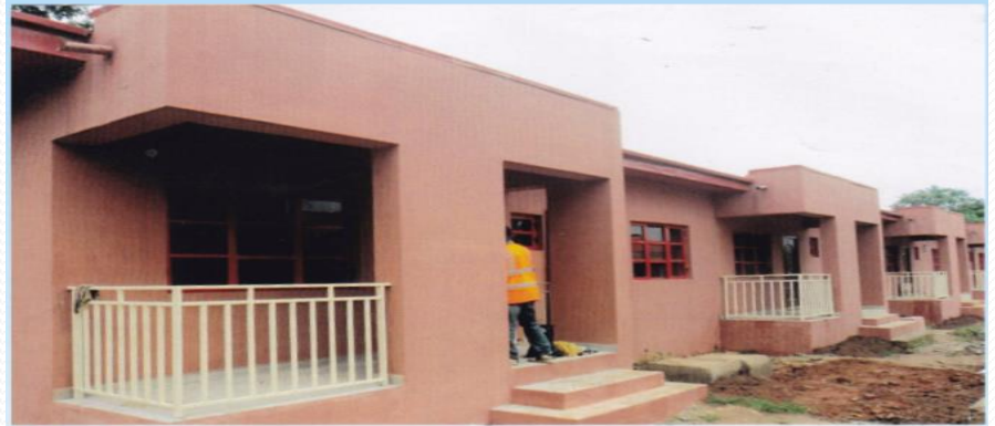
A Block of five flats/Staff Quarters at Gelegele