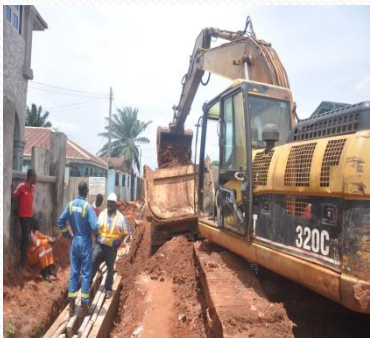
ON-GOING CONSTRUCTION OF EREDIAUWA ROAD AND OTHER 25 ADJOINING STREETS IN IKPOBA-OKHA L.G.A