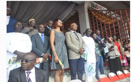
GRADUATION OF TRAINED TEACHERS BY SUBEB (EDO BEST)