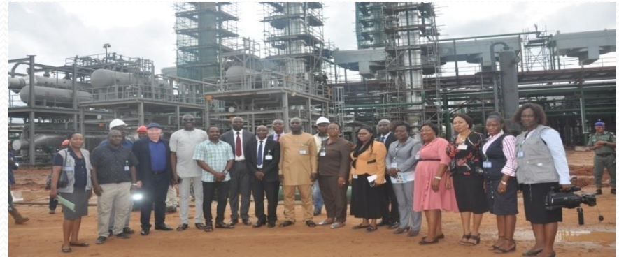
Visit to Network Oil and Gas Company