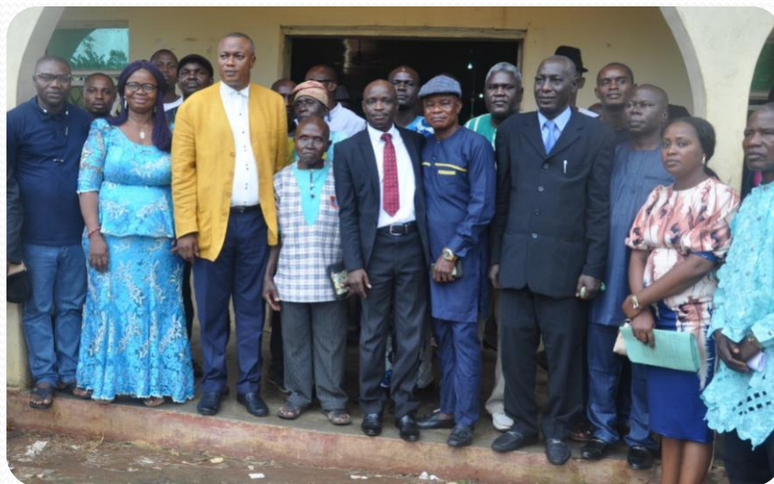
Ovia North-East L.G.A