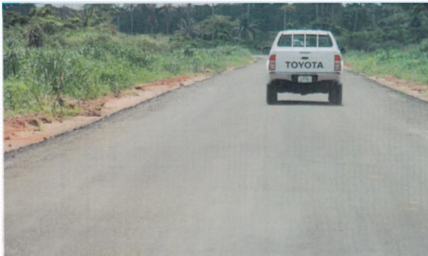
Construction and Asphalting of the 10km Benin-Abraka Junction-Urhehue-Umoghonokhua Road