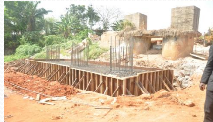
ABUDU BRIDGE UNDER CONSTRUCTION