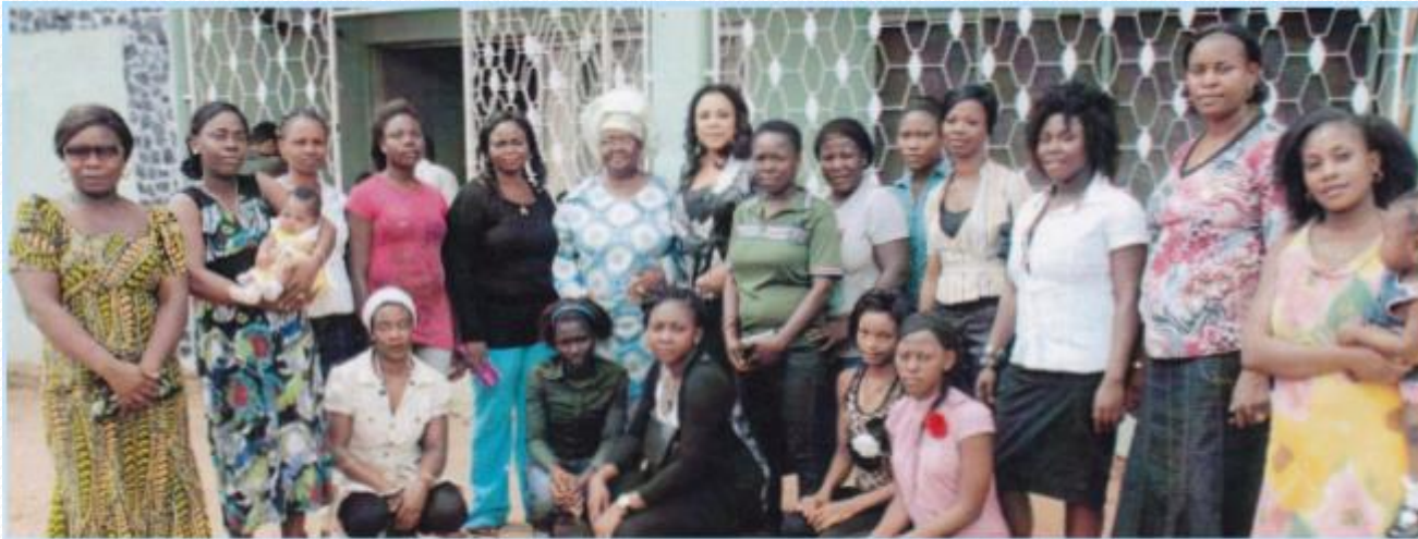
Induction Course for trainees from Ovia North East