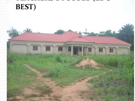
ON-GOING LIAISON OFFICE IN OVIA-NORTH EAST L.G.A