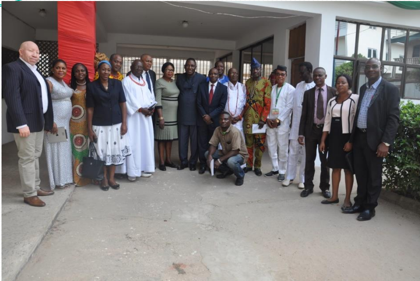
GROUP PHOTOGRAPHS WITH COMMISSION'S MEMBERS AND MANAGEMENT STAFF