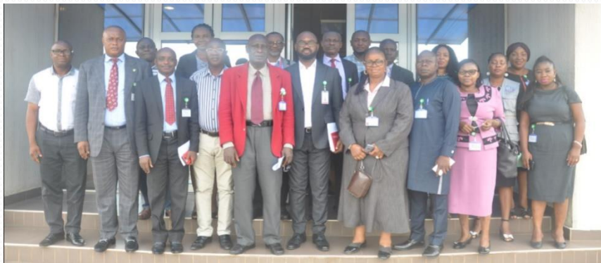
Visit to Pan Ocean Oil Corporation

Interactions with these Institutions have gradually opened up Areas of Cooperation as well as Technical and Material Assistance to the Commission.