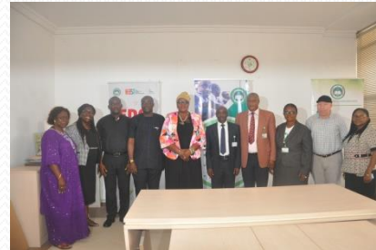
MEETING WITH SUBEB BOARD MEMBERS