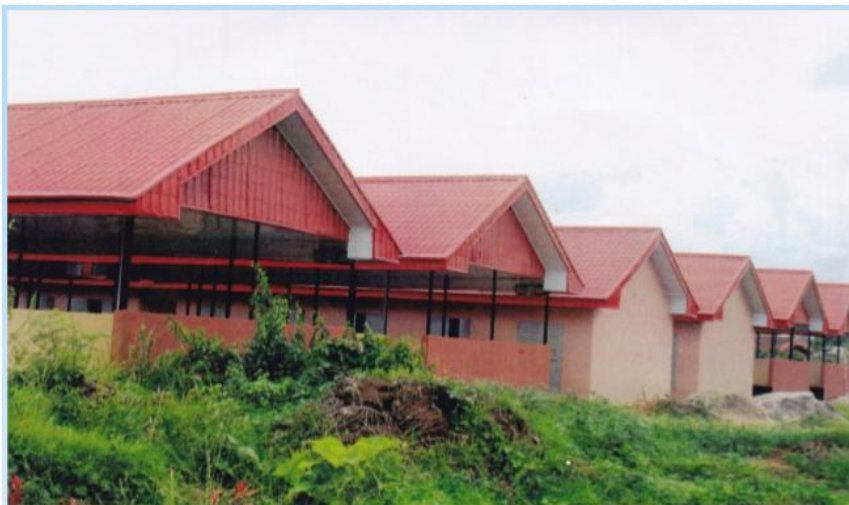
80 Open and 40 Lock-up Market Stalls in Orogho