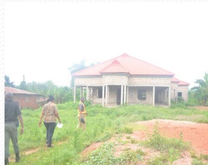
TOWN HALL AT ISIUWA IN OVIA-NORTH EAST